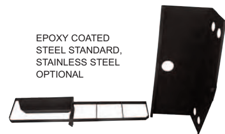
EPOXY COATED STEEL STANDARD, STAINLESS STEEL OPTIONAL