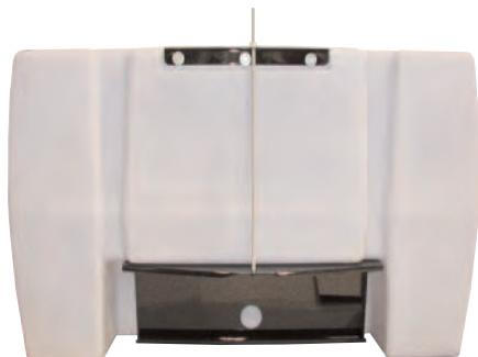
Backside of 110 gallon Tank