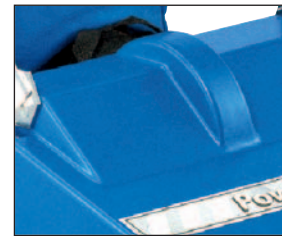
Precision Cast Vibration Free, Balanced Vacuum Impeller

3" Diameter Quadra Sweep Brush Roll is Capable of Picking up Objects as Large as Crushed, Empty Cigarette Packages Effortlessly! Large recovery vacuum bag keeps you on the job longer without the need for frequent dumping.