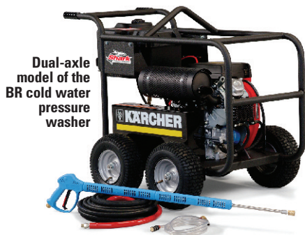
Dual-axle model of the BR cold water pressure washer

The Kärcher-Shark BR series is the most rugged cold water pressure washer on the market with two models that deliver cleaning power of up to 5000 PSI. Also in the line are four dual-axle models, including one model that is powered by a 10 HP Lombardini diesel engine.