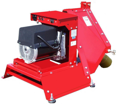
Three-point Hitch, includes PTO shaft (for model W15PTOS)