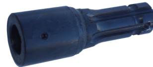
Spline Adapter (Use with 25PTOC-3) (1-1/8" i.d. - 1-3/8" 6 spline)