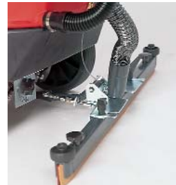
Fully adjustable squeegee for optimum pick-up