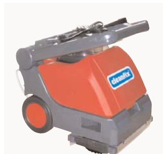
Compact for convenient storage and transportation