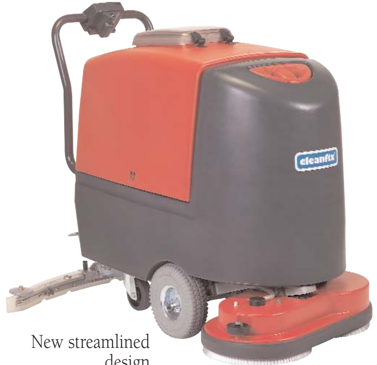
New streamlined design

The EAGLE is the powerhouse you want to rely on for maintenance or deep cleaning of large areas.