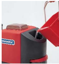
Easy to fill