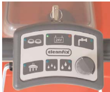
User-friendly control panel with universal symbols and key switch