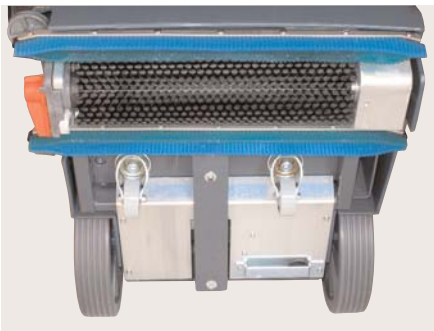
Full brush and strong vacuum ensure thorough cleaning tile and grout lines.

The compact design, large capacity and forward and reverse cleaning action allow the PENGUIN to clean where other auto-scrubbers won't go.