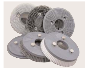
Variety of brushes and pads

Ideal for maintenance cleaning with up to 20,000 sq.ft. without re-filling!