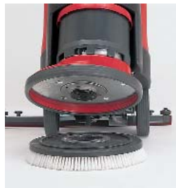
Easy mount and dismount of brush or pad driver