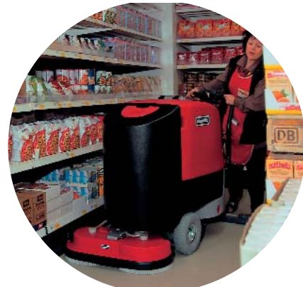
Extremely maneuverable, handles with the ease of a small scrubber