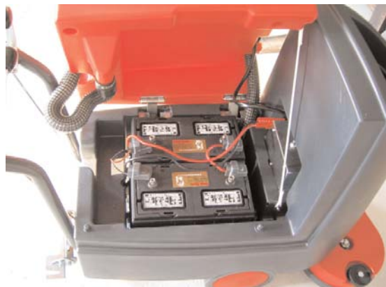
Easy access to batteries; low voltage battery protection

Improved vacuum system with muffler and superior recovery!