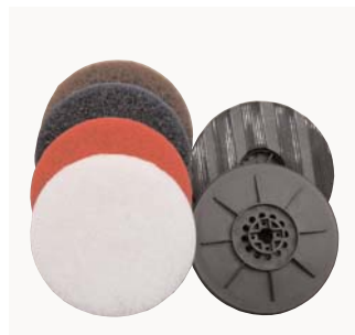
Optional: Pad driver and pads