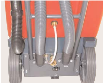
Standard quick disconnect to attach off-aisle wands and tools for tight areas, corners, stairs, etc.

The compact design, large capacity and forward and reverse cleaning action allow the PENGUIN to clean where other auto-scrubbers won't go.