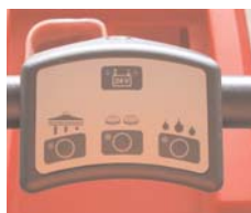
Easy to read, user-friendly control panel with universal symbols