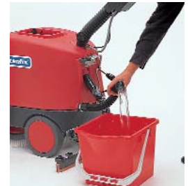
Easy to drain