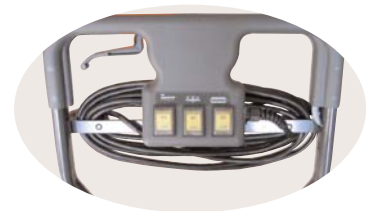
Ergonomically located controls