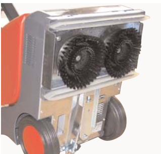
Counter-rotating brushes and raisable squeegees