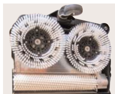
3 brushes dig into the roughest floor profile!