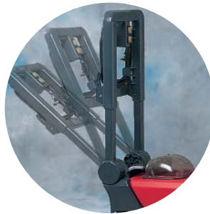
Fully adjustable and foldable telescopic handle

This compact scrubber is designed for daily maintenance cleaning of smaller areas and tight spaces. The PARROT cleans over 1,000 sq.ft. without changing the cleaning solution; and unlike mop & bucket the PARROT always uses clean solution and truly removes dirty solution and dirt from the floor. The PARROT leaves floors clean, dry and non-slippery. Floors are ready immediately.