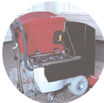
Easy battery access and large capacity, low voltage battery safety shut-off