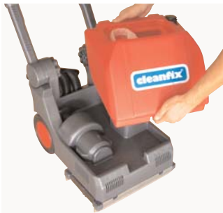
Easy filling and emptying

Ships complete! Out of the box ready to go!