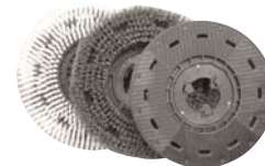
Variety of brushes and pads

The SWAN, CARDINAL and HAWK provides extreme maneuverability and flexibility for cleaning in open areas and obstructed spaces.