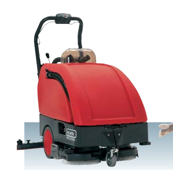
FALCON (RA 530 B) 21" Specialty auto-scrubber

Three brush system for rough, uneven floors.