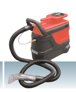
SPARROW Spotter Capacity: 3 gal.