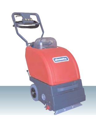
OSTRICH (TW Compact) Self-contained extractor Capacity: 9 gal. Forward and reverse cleaning action.