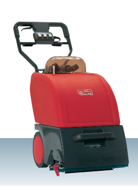
PENGUIN (RA 410 E) Tile-and-grout cleaner Capacity: 9 gal. Tile-and-grout cleaning and restoration.