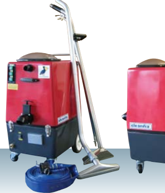
PELICAN EXTRACTOR PumpOut Extractor/flood pumper Capacity: 12 gal. , 40 gpm discharge 2 in 1 for carpet care and flood restoration.