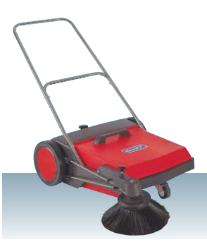
HS 770 Push sweeper Width: 30" Manual sweeper with adjustable brushes.