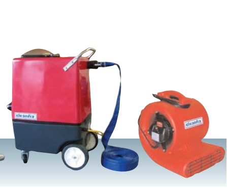
AIR MOVER Flood pumper 3-speed, 2,500 CFM, 6 amps Capacity: 20 gal., 40 gpm discharge Low current, high airflow for speedy drying.