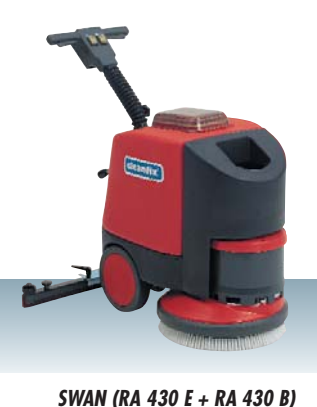
17" Auto-scrubber Capacity: 9 gal., electric or battery Great maneuverability for any job.