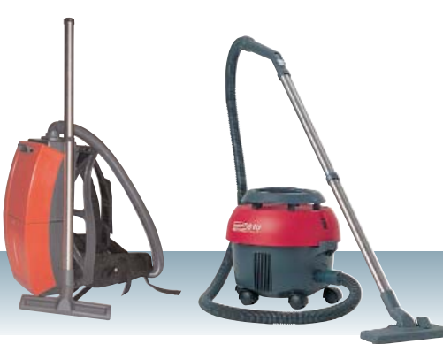
RS 05 Backpack vacuum Capacity: 4 qt. Light-weight with anti-fatigue design.