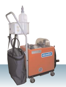
FIREBIRD (DS 7) Steam cleaner/extractor Runtime: up to 3 hrs. Powerful degreaser with vacuum recovery.