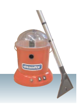
STARLING Carpet extractor Capacity: 2 gal. Convenient with handle and chemical holder. Compact for small areas and mats.