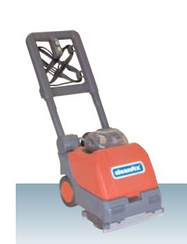
PARROT (RA 300 E) Maintenance scrubber Capacity: 4 gal. Compact for tight areas and quick clean up.