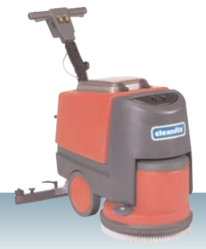
17" Auto-scrubber Capacity: 9 gal., electric or battery

CARDINAL (RA 431 E + RA 431 B) HAWK (RA 501 E + RA 501 B) 20" Auto-scrubber Capacity: 9 gal., electric or battery