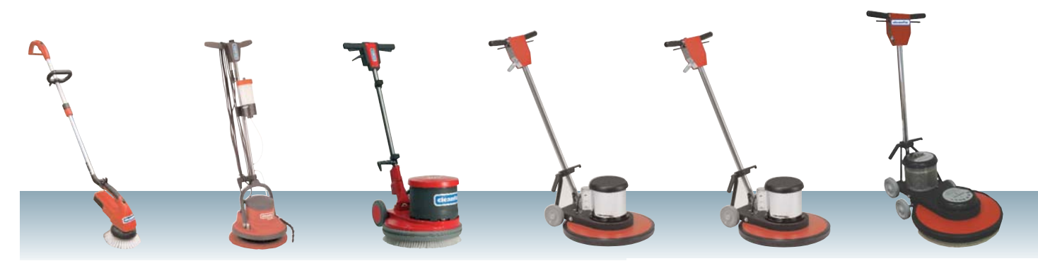
SCRUBBY 2 in 1 Power brush Size: 6.5" Ideal for tight spaces, stairs,