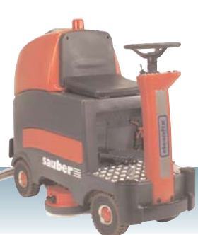
EMU (RA SAUBER) 30" Ride-on auto-scrubber

Capacity: 23 gal. For big areas and tough jobs.