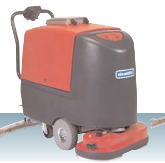
EAGLE (RA 700 B) 28" Auto-scrubber

Capacity: 13 gal. Easy handling even in obstructed spaces.