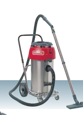
SW 25 KW Wet/dry vacuum Capacity: 7 gal. Durable, metal body with tipping dolly.