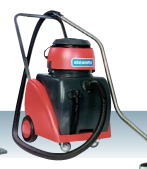
SW 50 Wet/dry vacuum Capacity: 13 gal. Rugged construction and large capacity.