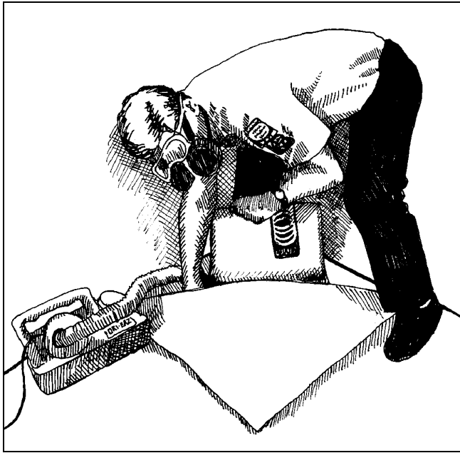
Using the MacroMist II to fog beneath carpet and pad