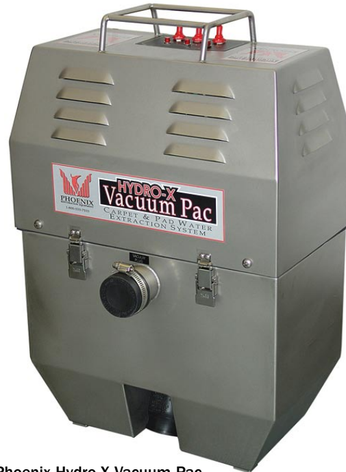
Phoenix Hydro-X Vacuum Pac PN 025601

The Vacuum Pac can be run separate from the Hydro-X Xtreme Xtractor and can run with standard wands, water claws, and any other extraction tool allowing for a 2 in. connector.