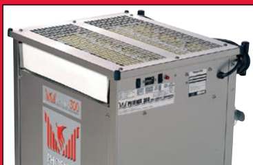
Integrated cord and drain hose management

Phoenix dehumidifiers feature significant air filtration. Even the standard 57% MERV-8 filters remove over 90% of seven-micron particles (the size of a human red blood cell). This filtration dramatically improves the air quality in the areas being dried and assures continued optimal performance of the refrigeration system.