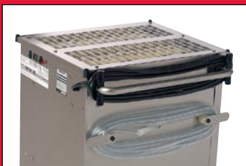
Easy access controls, integrated filtration and stainless steel construction