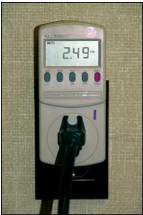
Low Amp Draw - 2.5 Amps