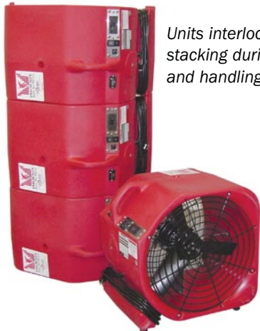
Units interlock for ease of stacking during storage and handling.