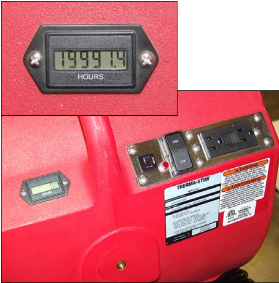
Innovative control panel includes power-on light, run-time hour meter, GFCI outlet and more.