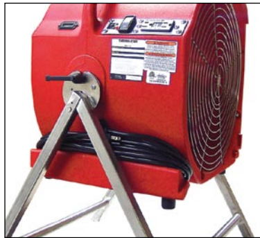
Available stand* provides a 360° range of motion, ideal for drying hard to reach areas.