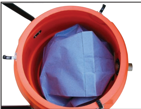
High efficiency 2-ply enclosed, disposable paper filter bag acts as the primary filter to trap and hold dry material for easy handling and disposal. (B524253)