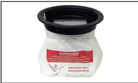
Complete HEPA Filter Assembly consisting of air seal gasket, polyester prefilter, spacer sleeve and Dacron filter bag (B160009)