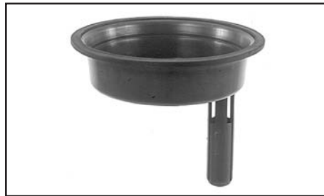
Wet pickup adapter with reliable float shut-off (B260200)