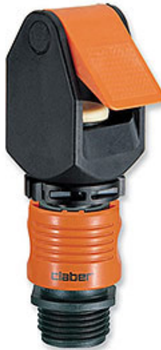
Claber: Koala 8583 Indoor Faucet to Garden Hose Connector

Optional Clean Storm Grout Master Cleaning Tool 300psi - 1200 psi 20190919 Wand For the first time in history, pressure wash tile and grout with a standard 500 psi portable carpet cleaning machine. No high pressure pump required. Watch Video On Link!