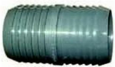
Hose Cuff Connector 2" Barbed to 2" Barbed Plastic