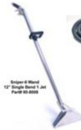
Sniper-6 Wand 12" Single Band 1 Jet Part# 80-8008