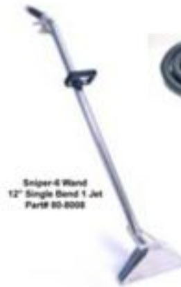
Sniper-6 Wand 12" Single Band 1 Jet Part# 80-8008