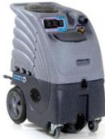
Sniper-6 Wand 12" Single Bond 1 Jet Part# 80-8008