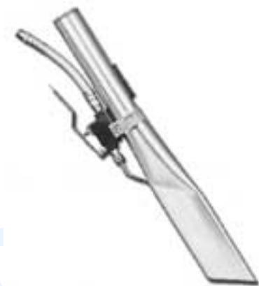
PMF: Internal spray crevice wand 500 psi

Extended Warranties for Equipment Valued up to 7499.99 Available