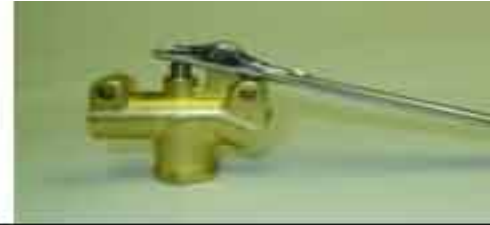
Model 251 - 30