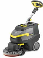
BD 38/12 C BP