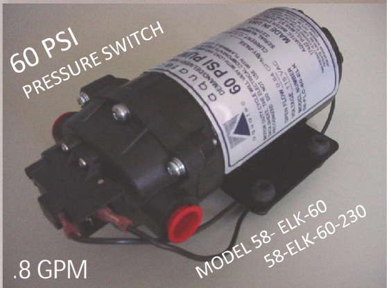
MODEL 58-ELK-60 58-ELK-60-230