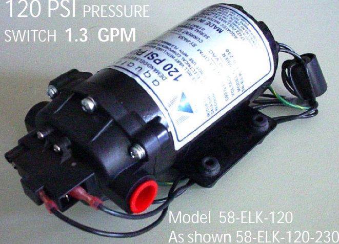
Model 58-ELK-120 As shown 58-ELK-120-230