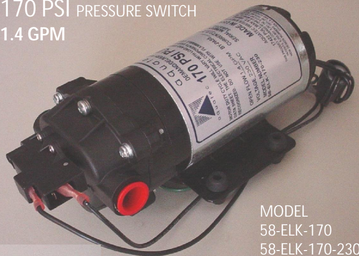
MODEL 58-ELK-170 58-ELK-170-230

220 PSI PRESSURE SWITCH THE HIGHEST AVAILABLE ON A DIAPHRAGM PUMP 1.4 GPM