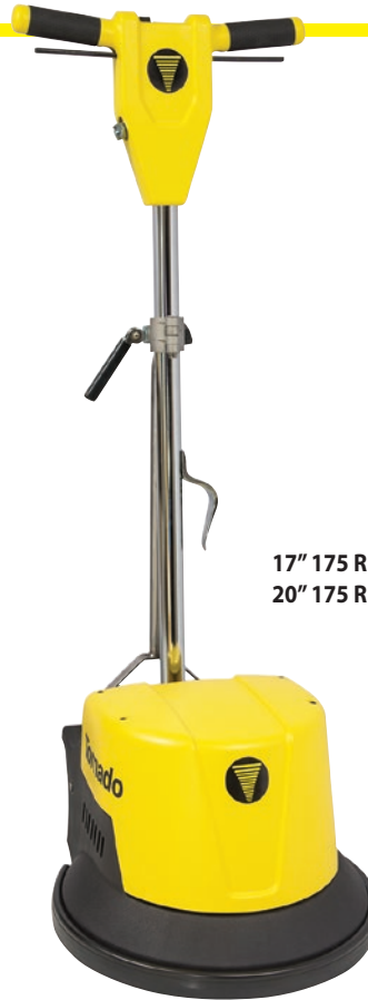
17" 175 RPM FLOOR MACHINE 20" 175 RPM FLOOR MACHINE

From daily polishing to heavy scrubbing or stripping, the Brute Force Series from Tornado® has what it takes for the cleaning and maintenance professional. These units will maximize cleaning efficiency, minimize equipment downtime and are offered at a price that runs circles around the competition.