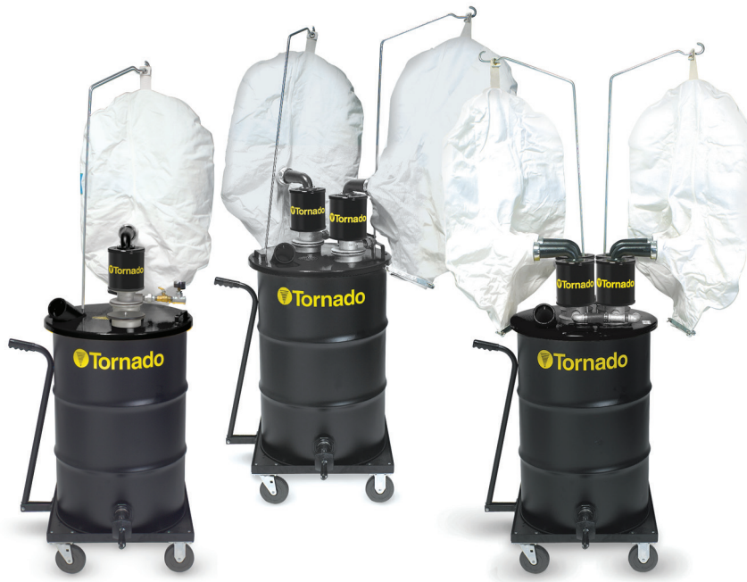
SINGLE AIR JUMBO