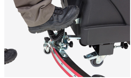
FOOT CONTROLLED BRUSH LEVER