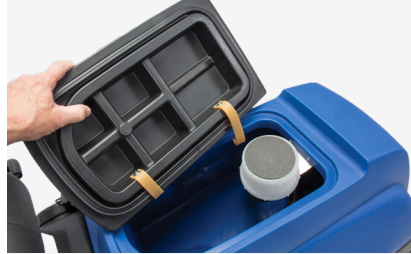
RECOVERY TANK FILTER