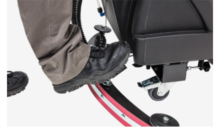
FOOT CONTROLLED BRUSH LEVER