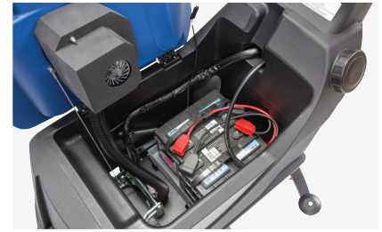
EASY ACCESS TO MOTOR, BATTERIES AND TANKS