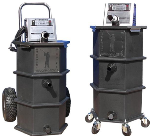
If your customer wants portability, choose one of the wheel kit options for indoor or outdoor use: dolly style or casters

The RPV includes a lift out basket strainer to protect the pump by collecting large debris