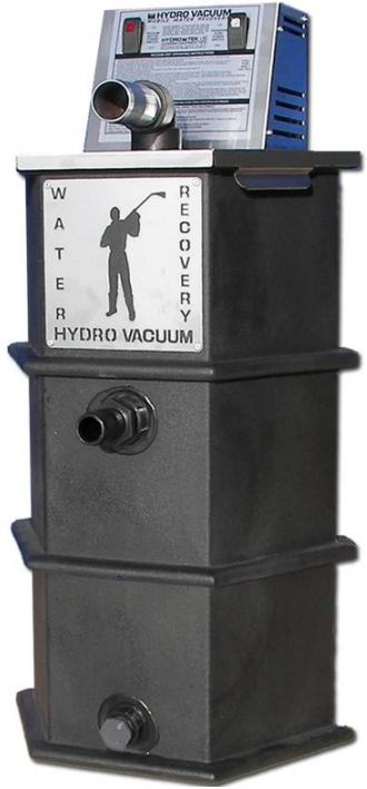
Easy to use, lighted vacuum switches control vacuum & pump out functions.

Additional information and video are available at http://www.hydrotek.us/pr/news.htm or contact the Inside Sales Department at (800) 274-9376 x3