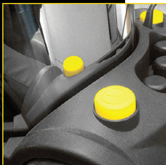
EASY ACTIVATION – Large, easy to access on/off switch