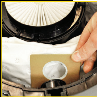
MAXIMUM POWER FILTRATION – Includes three layer fleece filter bag, permanent main filter, and motor protection filter, and HEPA exhaust filter