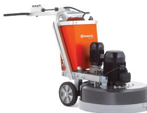
HUSQVARNA PG 820 965 19 56-12