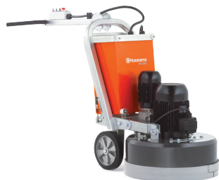
HUSQVARNA PG 680 965 19 57-12