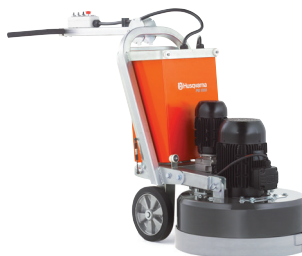
HUSQVARNA PG 680 965 19 57-13