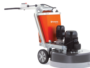
HUSQVARNA PG 820 965 19 56-13