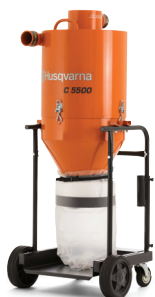
HUSQVARNA C 5500 967 66 46-01