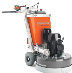
HUSQVARNA PG 680 RC 967 62 27-03