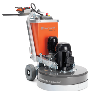
HUSQVARNA PG 820 RC 967 30 29-02