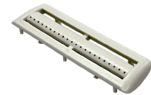
Glide Part Number P601A