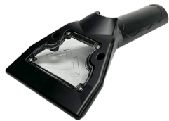
Mytee Dry™ GT Top Housing