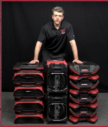
The Perfect Drying Solution

ULTRA-COMPACT, LARGE CATEGORY PERFORMANCE