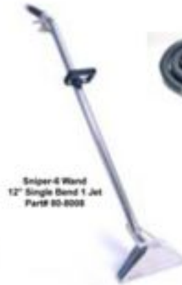
Sniper-6 Wand 12" Single Band 1 Jet Part# 80-8008