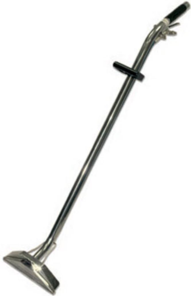
Samco: 12in, 1200psi, Double Bend, Double Jet