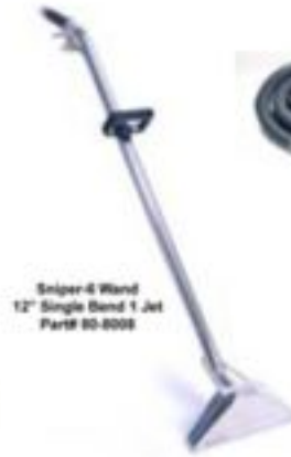
Sniper-6 Wand 12" Single Band 1 Jet Part# 80-8008