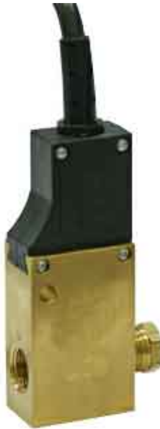
EZ Power: Low flow Switch to convert pressure washer for carpet cleaning [ezlowflo]

If you are going to use the optional 18 gallon tank you must also use a fuel primer bulb and check valve on system.