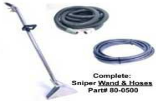
Complete: Sniper Wand & Hoses Part# 80-0500