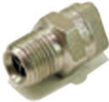
Spraying Systems: VeeJet 1/8" Mip 1502 Stainless Steel Jet Nozzle

Price list 11/27/10 (subject to change without notice)