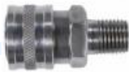
QD Female Coupler X 1/4 in Mip Stainless Steel 8.707-110.0 - Legacy Shark 2-2001SS

5 Micron In Line 1/4" Fip Water Filter 10" X 2"