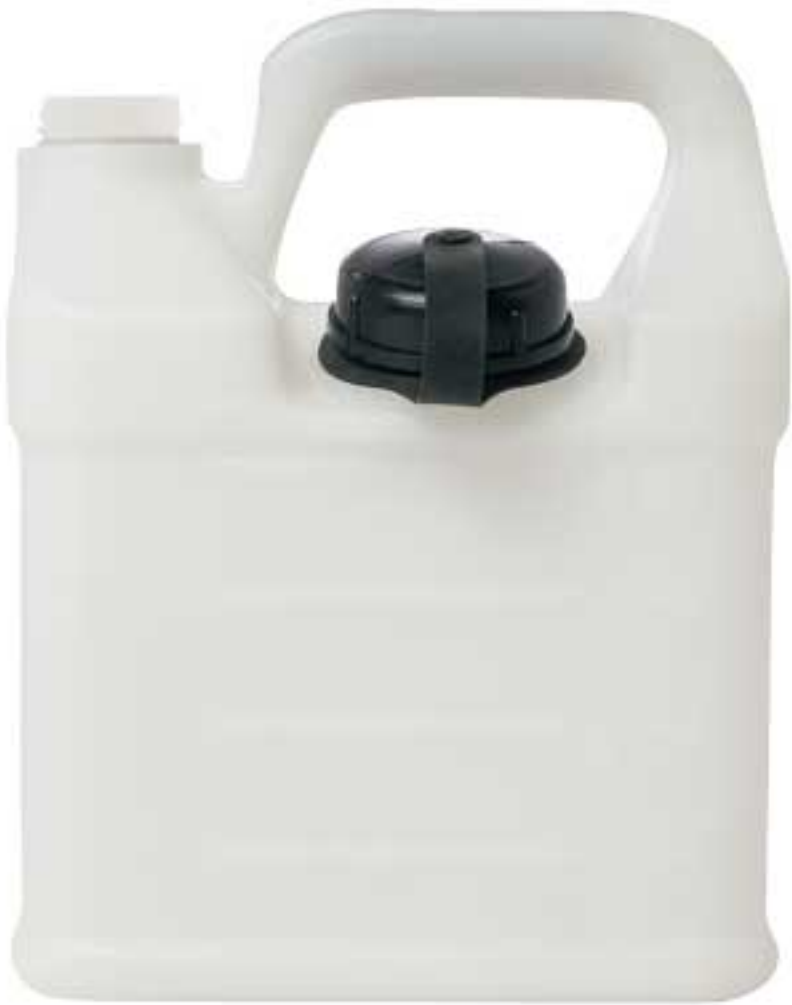
Hydro-Force: Injection Sprayer 5 Qt Rotomolded Jug with side mount