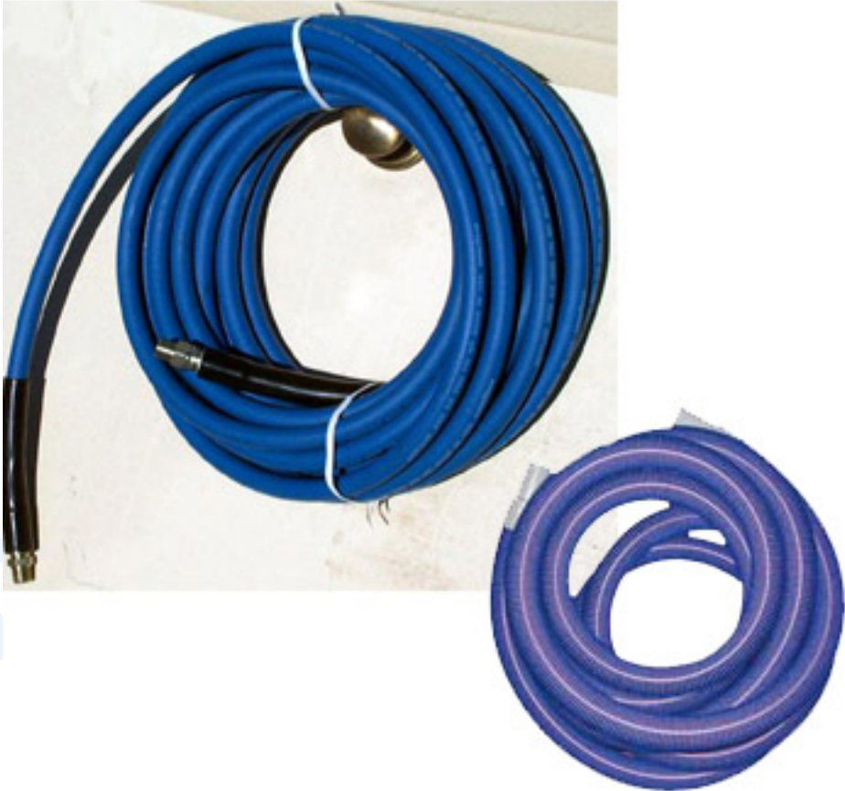
.Shazaam Set50: Hose Set - 50ft (15 meters) x 1.5 in - Vacuum & 1/4in Solution